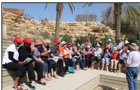
Renewal of Baptism Vows - River Jordan

Perhaps it is also a preview of the life of all the baptized. In our baptism God claims us as beloved children. We are tempted- life is filled with temptation – we resist, or repent from, temptation. We are called to proclaim the good